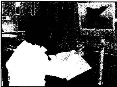
Follow our instructions carefully

We may recommend that you take an anti-inflammatory medication before your appointment.